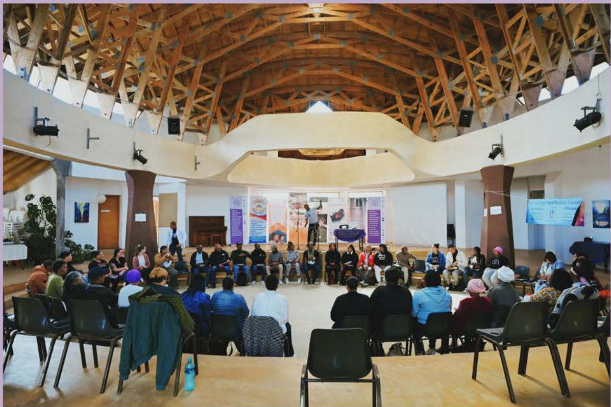
Stakeholders and Duty-bearers across the 3 platforms in Paarl, Philippi and Mitchell's Plain; connecting on the strategic plans for 2024

The SAFE Platform, or Strengthening Actors for Effective Preventive Response (SAFE-PR), is an initiative developed by MOSAIC Training Service & Healing Centre to coordinate local domestic violence (DV) prevention and response efforts in three South African communities.