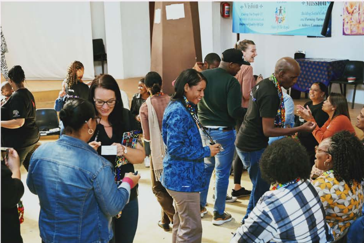
SAFE Conference participants playing "Name Tag bingo" to get to know one another's names.

Welcome and getting to know each other exercise. Stakeholders were given name tags to find the person on the tag as an ice-breaker and getting to know each other activity.