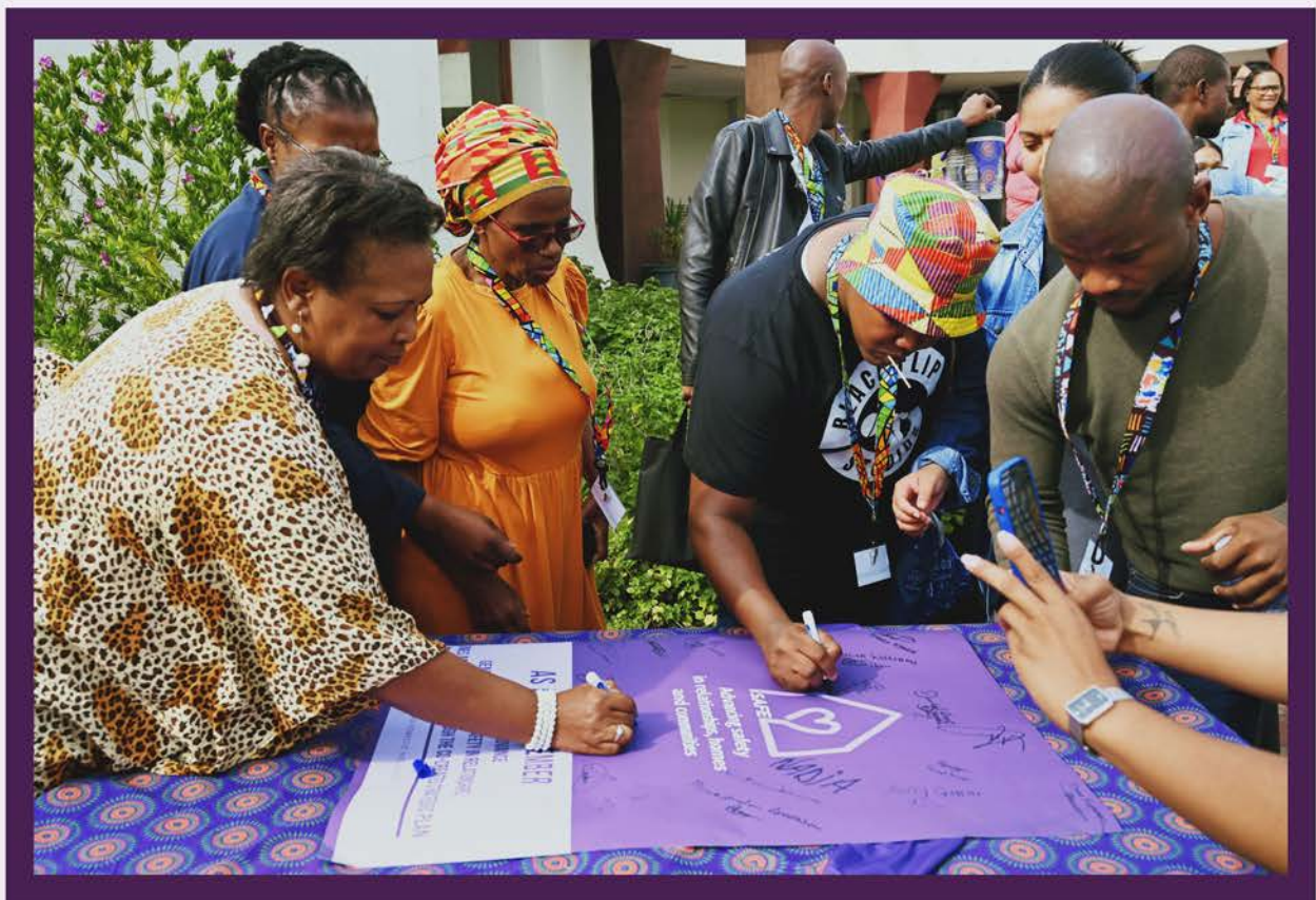
Stakeholders and Duty-bearers signing a pledge to commit to the strategic planning co-created at the Conference.